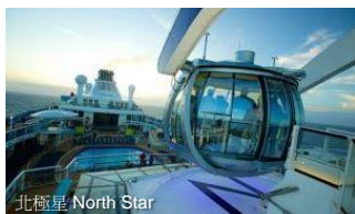
北極星 North Star

3 nights cruise accommodation with meals and selected onboard entertainment 3 晚郵輪假期連食宿及特選船上娛樂