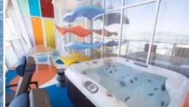
終極家庭套房 Ultimate Family Suite