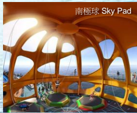
南極球 Sky Pad