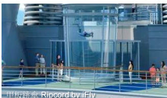
甲板跳傘 Ripcord by iFly